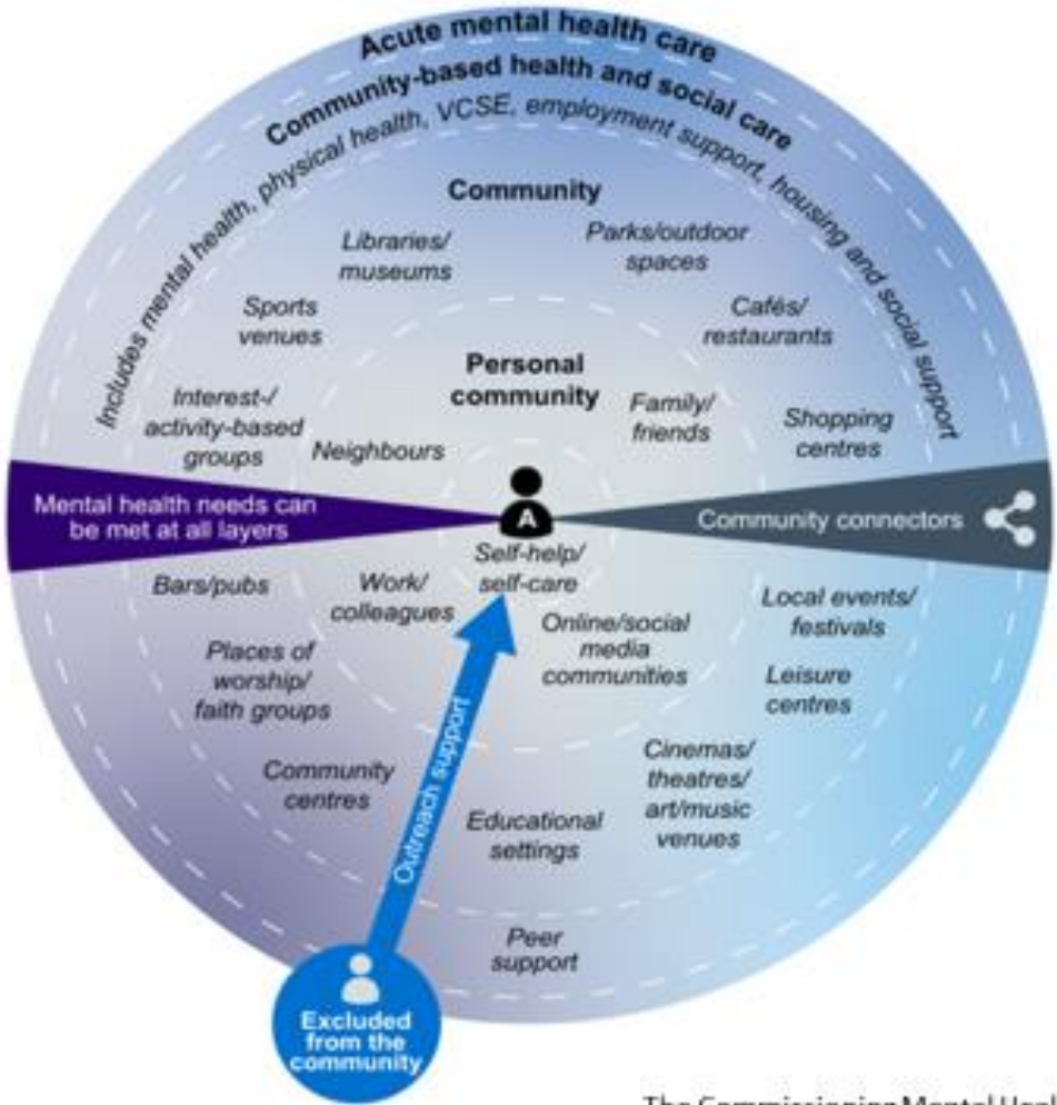
The Commissioning Mental Health framework for adults and older adults (NCCMH September 2019)

What does a whole system approach to mental health and well being look like?